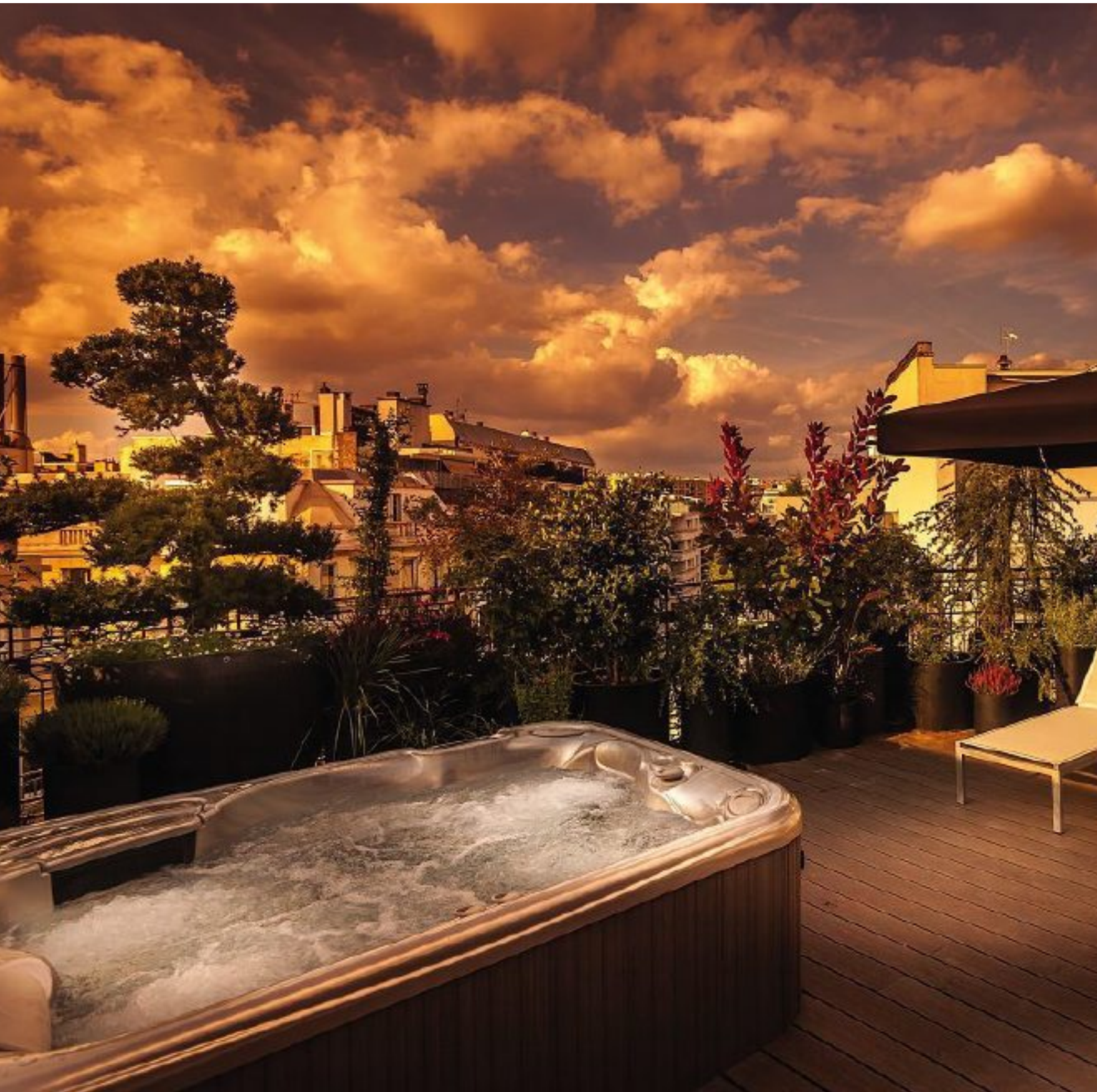
Hotel Felicien roof terrace